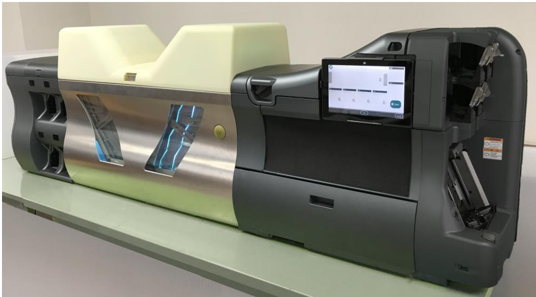
Photo of the Currency Disinfector

Proven to inactivate more than 99% of viruses which have similar structure to COVID-19